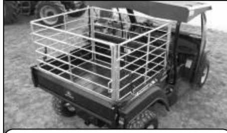
Part #377 – Stockcrate

Hot dip galv tube for strength, life & safety, features 2 in 1 door options (sliding ½ door & hinging whole door). Includes four Mtg straps