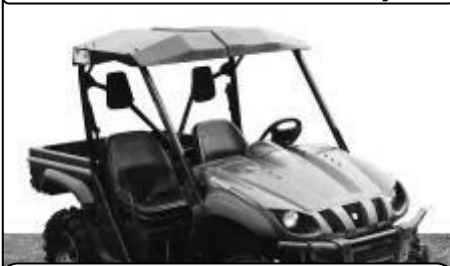
Part # 346 – Hard Roof Only Kit

Plastic roof can be mounted on its own for overhead protection from sun & rain. w/screen units #327/328 can be added later if desired.